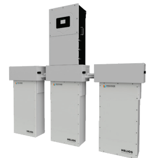
Inverter not included. For illustration purposes only.

a. If 2/0 AWG is oversized for the application / b. If lifting assistance is needed / c. If installation requires longer cables / d. Required for integration with LYNK Cloud for remote monitoring, programmable relays and closed-loop communication with Schneider, SMA and other inverter chargers.